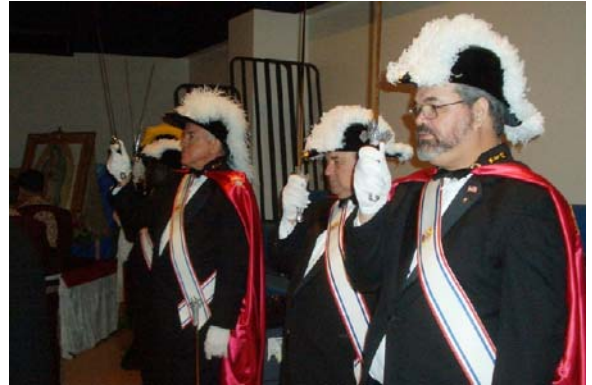
4th Degree Honor Guard for the liturgy celebrating Our Lady of Guadalupe anniversary