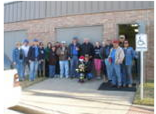
Brothers and families participate in annual Pillows & Blankets delivery event. Many Ft. Bend families received needed items for the winter season.