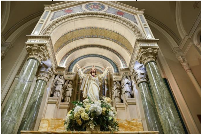
Jesus Resurrected, St. Patrick Cathedral, El Paso, Texas