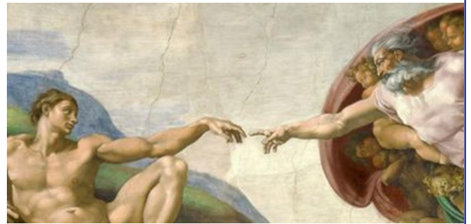
"Creation of Adam," Fresco by Michelangelo, Painted c. 1508-1512 on Sistine Chapel Ceiling, Vatican City.