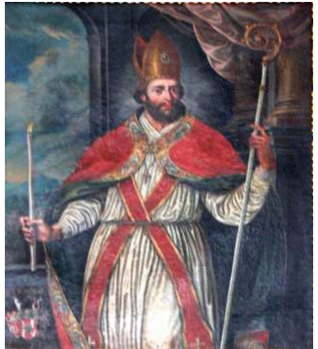
Saint Blaise, 1740, Maria-Trost Church, Berg bei Rohrbach, Austria. In his mitre and cape Saint Blaise holds the crozier in his left hand. These signify his role as a bishop. The candle in his right hand is one of his attributes, referring to a ritual blessing of the throats of the faithful commonly observed on his Feast Day, February 3, 2024. Candlemas is the day before, February 2, 2024. ( https://www.christianiconography.info/blaise.html )

There will be many activities at the [continued on page 2]