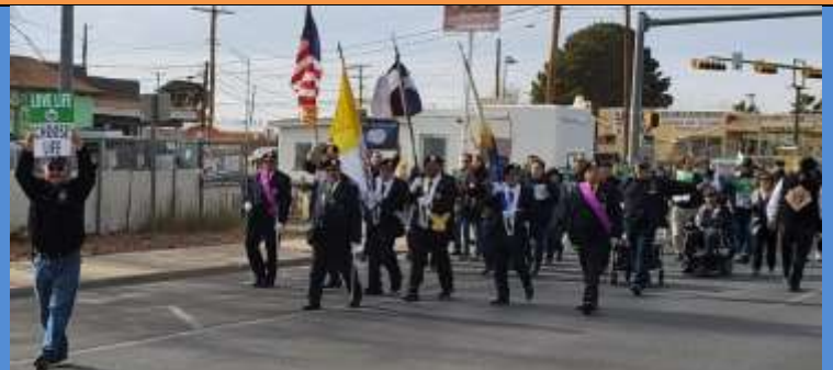
Escorted by El Paso Police Department patrol cars and motorcycles, the Marchers went east on North Loop to Lee Trevino, turned around on North Loop and went to Yarborough, turned around on North Loop and returned to the start point at Saint Matthews Street. Approximately 100 Knights, family members and friends made the 45-minute March.