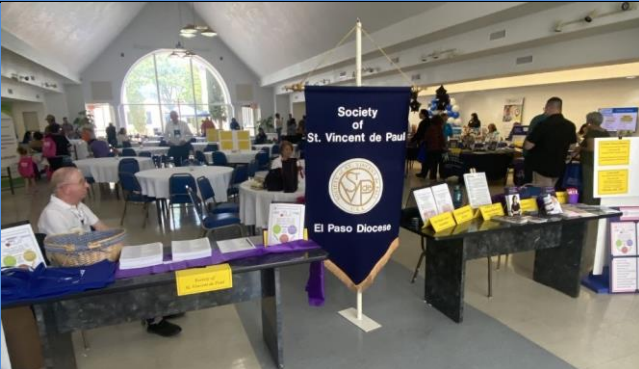
At the entrance to the Health Fair, attendees picked up a sheet listing all 80 healthcare vendors to be eligible for door prize drawings. In background to right of SK Joe O'Connor (left center), Rio Grande Council 14413 was grilling in the courtyard.