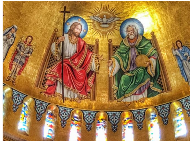
The Feast of the Holy Trinity is June 4. This Holy Trinity mosaic is located at the Trinity Dome, Basilica of the National Shrine of the Immaculate Conception, Washington, DC.