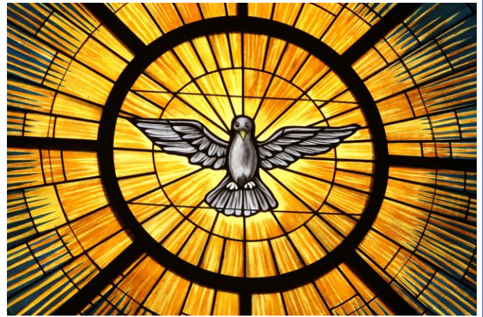
Holy Spirit

His appreciation for the Sir Knights and Knights who attended. I was impressed by the great showing of the El Paso delegation. Thanks for a great Fraternal Year!