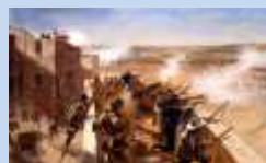
Battle of the Alamo (March 6, 1836)