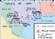
War of Texas Revolution 1835-1836