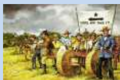
Battle of Gonzales (October 2, 1835)