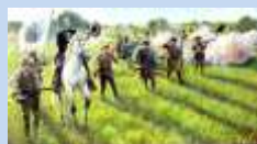
Battle of San Jacinto (April 21, 1836) (Gen. Houston on Horseback)