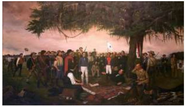
Surrender of Santa Anna, William Henry Huddle, 1886, Oil on Canvas, Texas State Capitol, Austin, TX (General Sam Houston, wounded in the ankle and lying down, takes the surrender of General Santa Anna [left in private's uniform of white trousers] after winning the Battle of San Jacinto.)