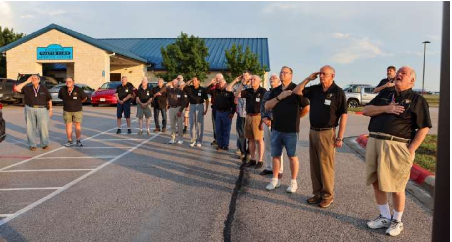
Assembly members salute the flag, or place their hands over their hearts, as they watch the hoisting of the flags. Monsignor Carr Hall can be seen in background.