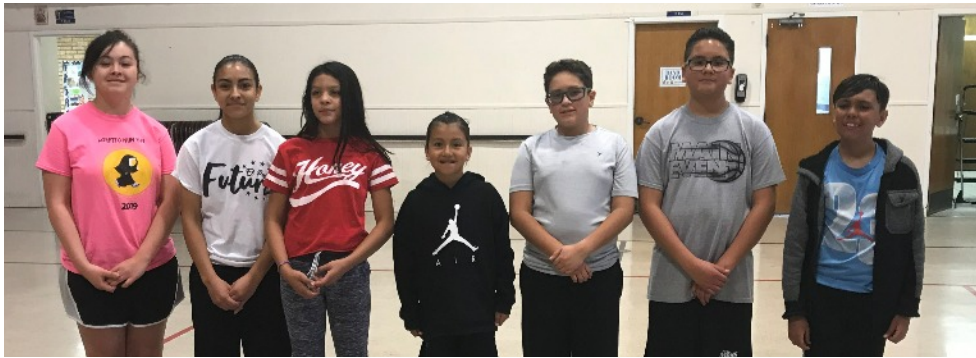
Pictured above are all the regional participants representing councils from El Paso District 2: St. Raphael, St. Mark and Mother Cabrini.